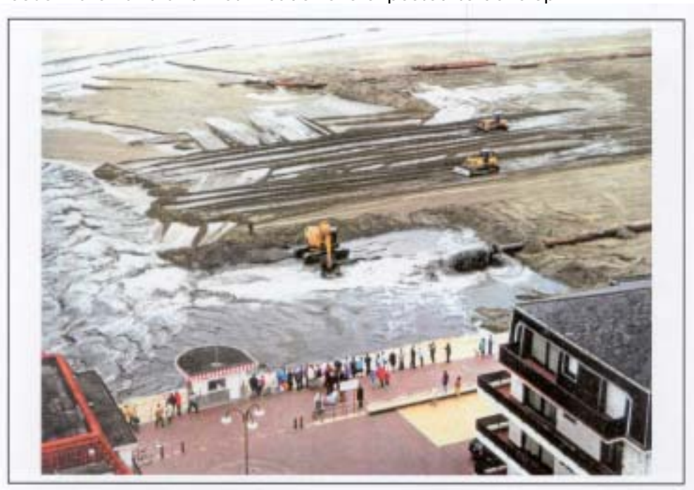
Fig. 7: Beach profiling works at De Haan.

In the past dunes were stabilised by placing fences and planting marram grass. Also marine erosion was prevented by building dykes in front of the dune belt. Fore dunes are now allowed to follow natural dynamics again with maintenance of the present shoreline. The main task is to restore herbaceous habitats. Therefore scrub has been removed followed by grazing with horse and cattle (pattern - oriented management). Also part of restoration is spontaneous woodland development by removal of exotic tree-species and grazing by donkeys (process - oriented management). By diminishing the extraction of groundwater and drainage in the polders, and allowing some sand drift a natural dune fringe landscape with calcareous marshland and wet meadows is expected to develop.