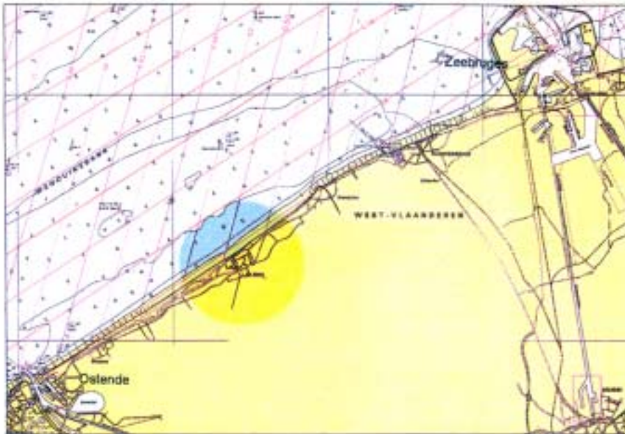
Fig. 3: Case area De Haan.

long-stretched Flemish Banks are located in the North Sea. The dunes are 60 to 600 m wide in most parts, only at the Dutch and French border the dunes are 2 - 3 km wide.