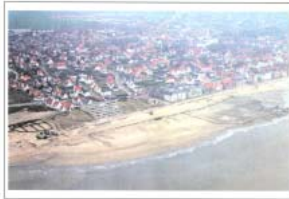
Fig. 4: Site De Haan during performing of works.