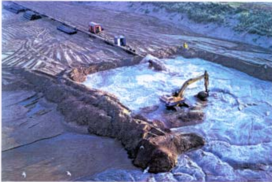
Fig. 6: Profile nourishment at De Haan.

No information was found on the costs of the feeder berm and nourishment combination.